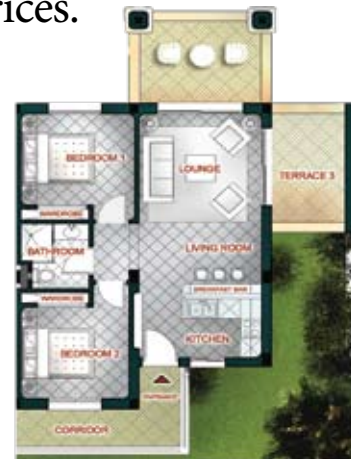
2 BEDROOM APARTMENT FLOOR PLAN (65m 2 )